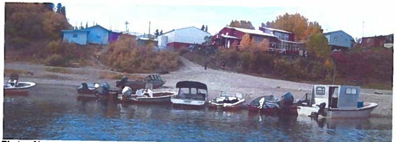
Photo of barge and boat landing and narrow access road during normal water lever during summer/fall months.