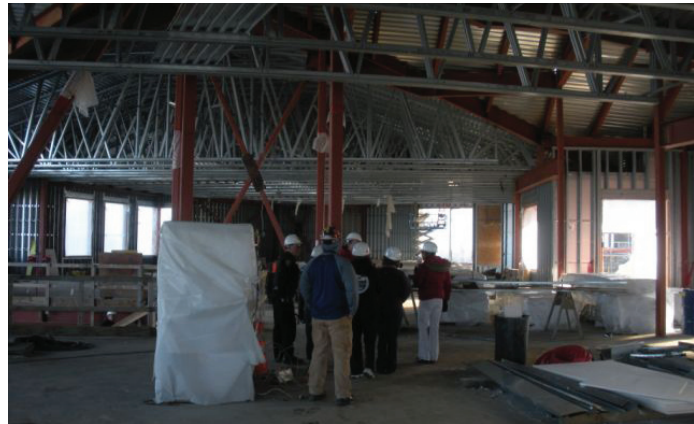
The Cordova Center is a community-based project developed to address the needs of Cordovans and benefit the Prince William Sound Region and the State of Alaska.