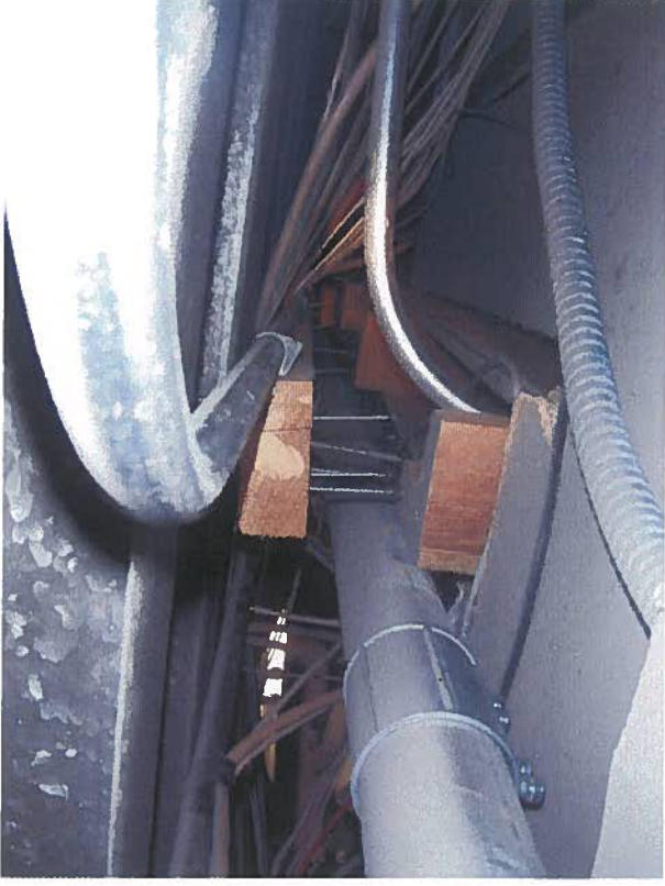
Studs in the ceiling have come apart