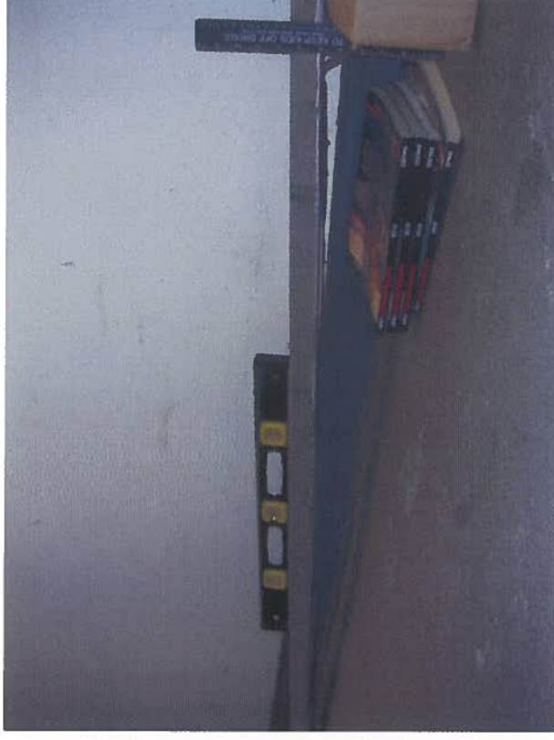
Hallway floor has settled by over 10 inches.