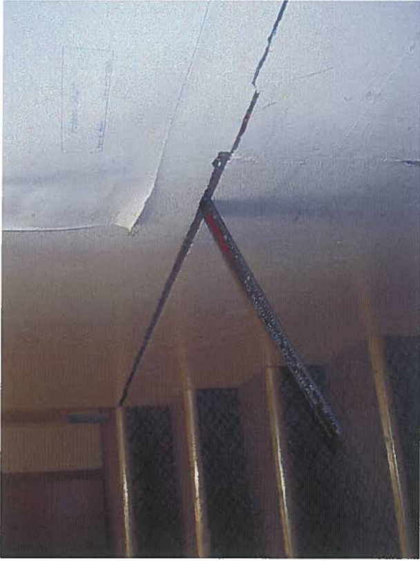
Separation in the wall of the stairway