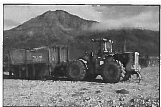
False Pass received a #4 fully-welded Summit Burn Box that was assembled and barged from the factory in Anchorage.