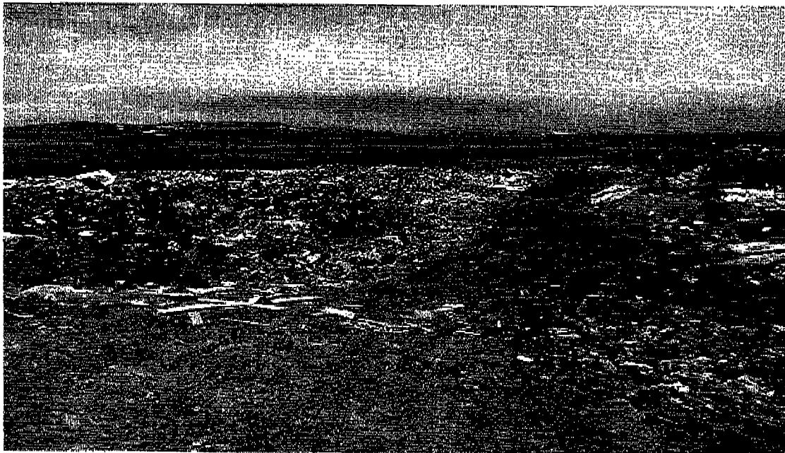
Picture above shows inside of the dumpsite on the right side from the entrance area. You can see in the foreground some debris that the wind has blown out from dumpsite.