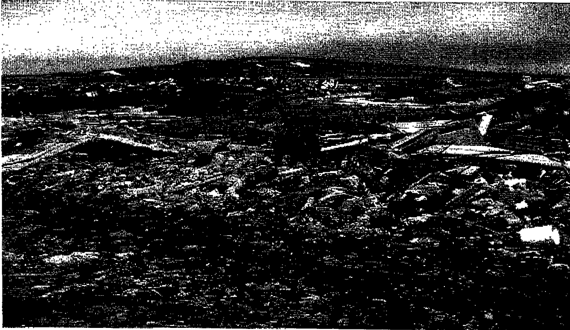
Picture above shows the entrance on the right side of the dumpsite. There is no gate to keep children and animals out from the dumpsite. No warning signs again.