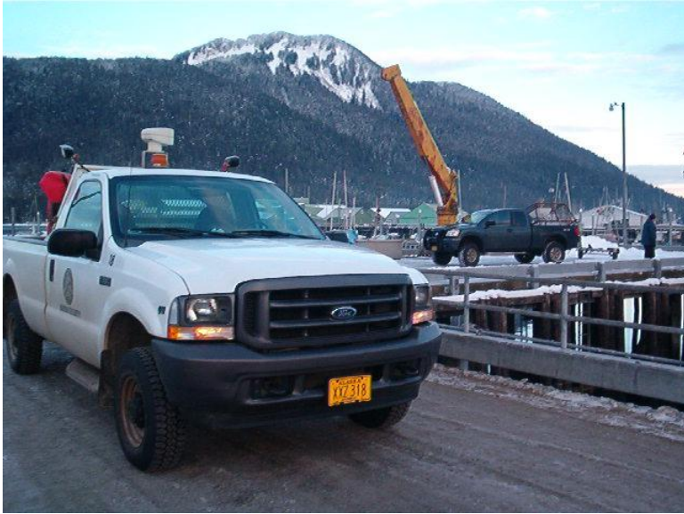
Vehicle Access on Crane Dock