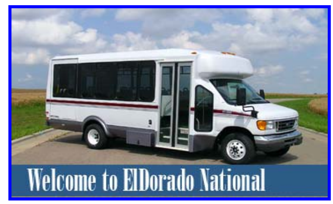
AEROTECH – AMERICA'S #1 CHOICE SINCE 1985!