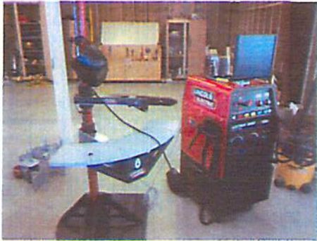
New Welding Simulator for SSEATeC.