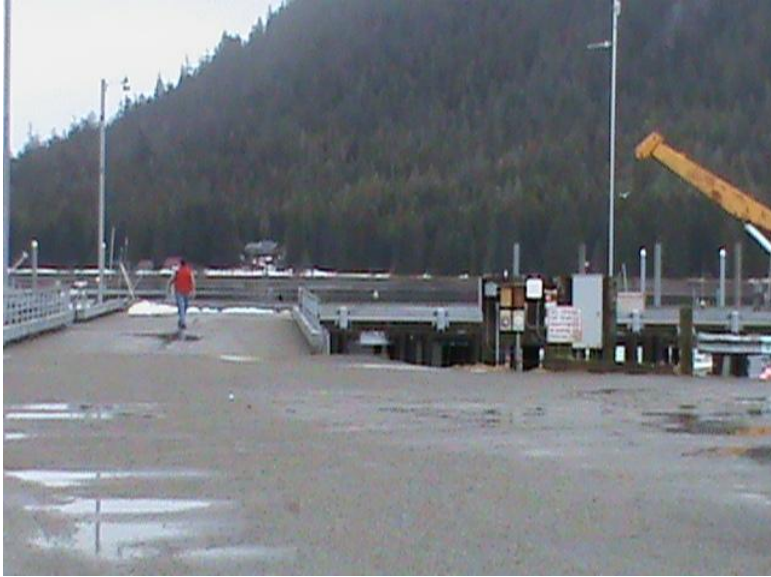
Mix of Pedestrian/Vehicle Access to Crane Dock & South Harbor