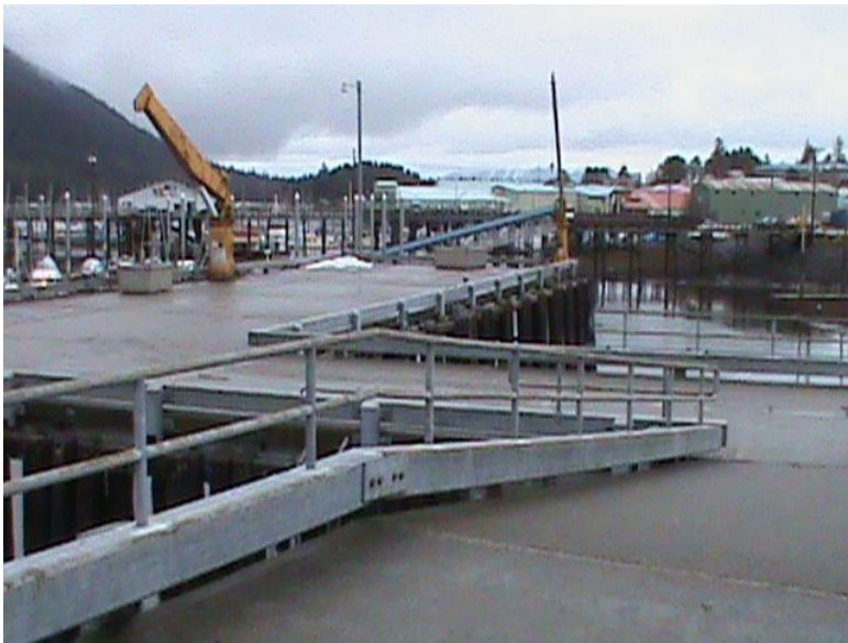
View From South Harbor Pedestrian Ramp Onto Crane Dock Access