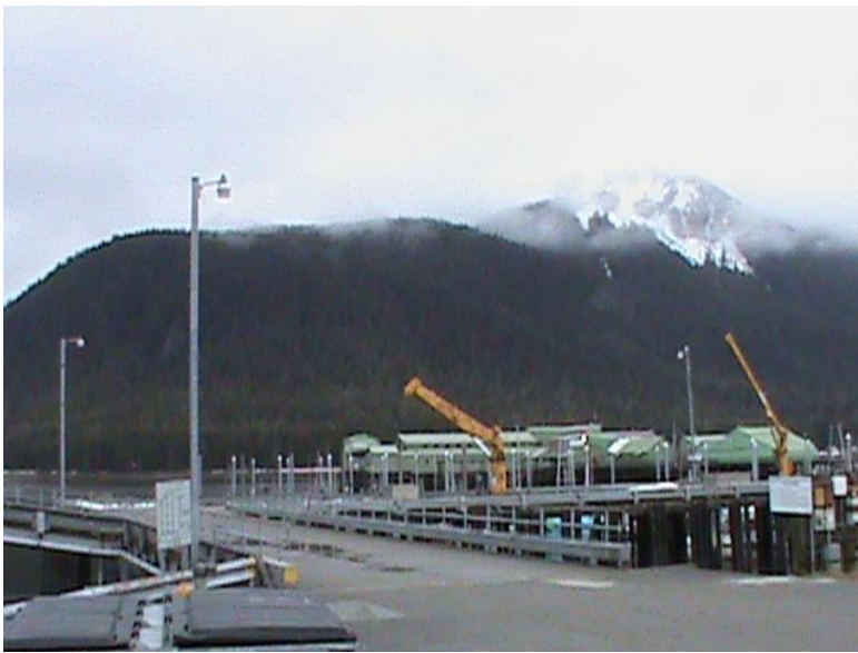
View of Crane Dock