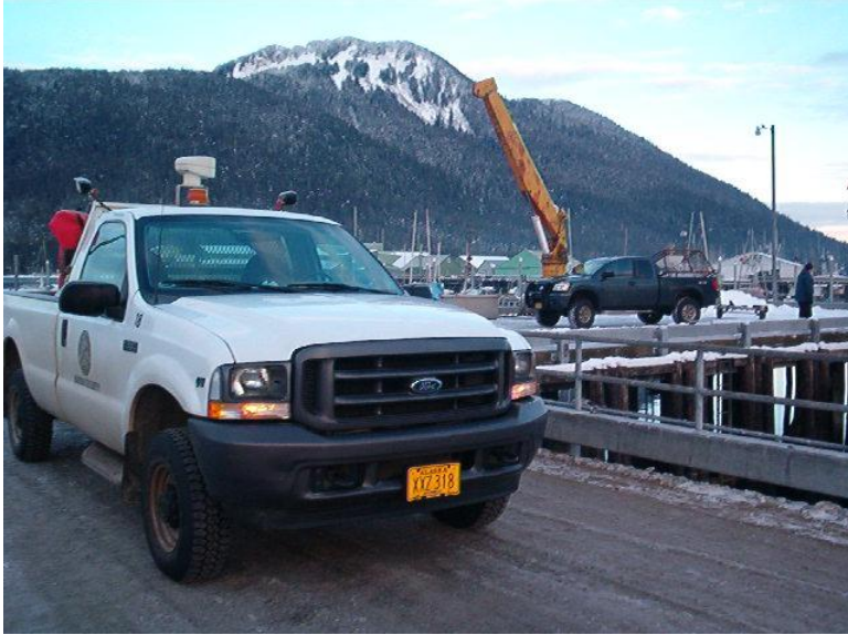
Vehicle Access on Crane Dock