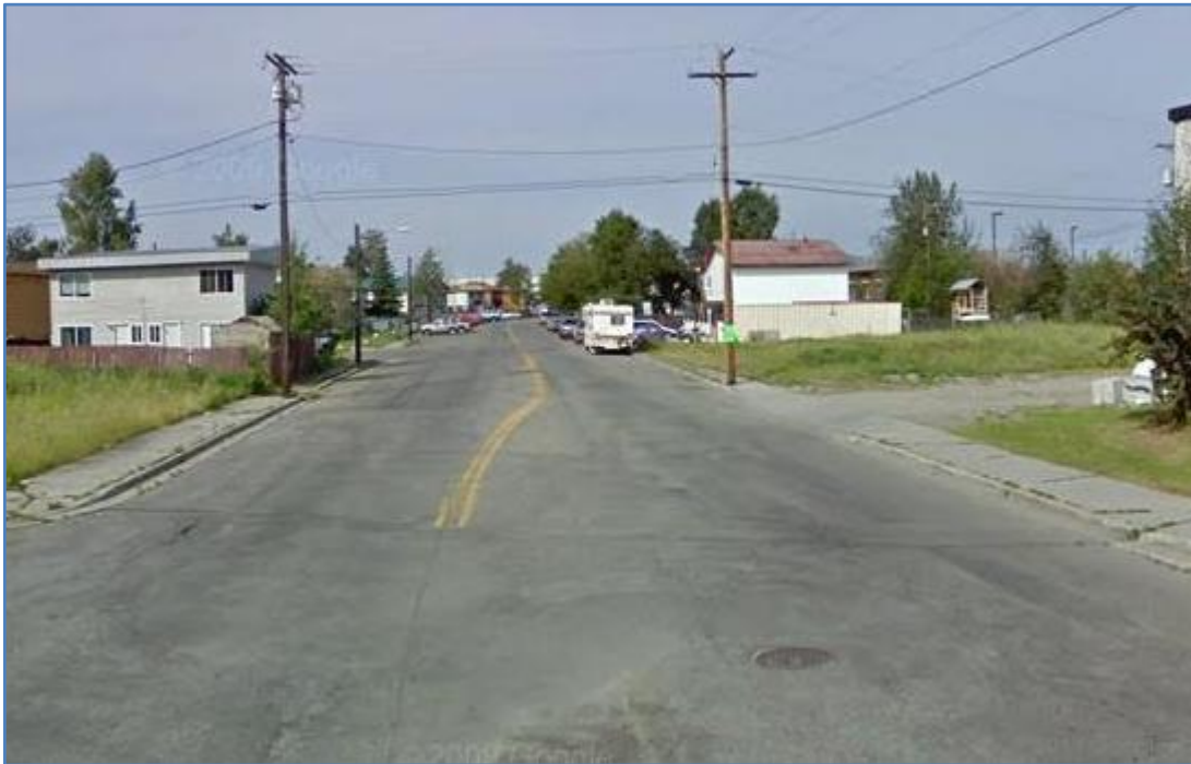
Figure 1. Typical Road Conditions (Kennicott Avenue)