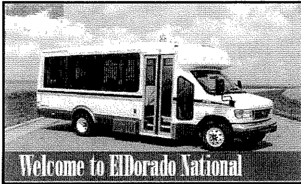
AEROTECH – AMERICA’S #1 CHOICE SINCE 1985!