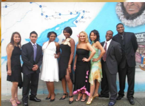
YEA! INC. MODELS