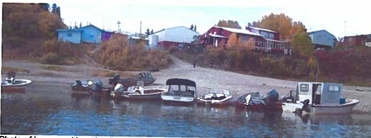
Photo of barge and boat landing and narrow access road during normal water level during summer/fall months.