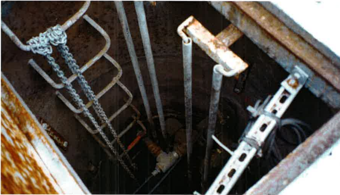
Photo 27. Lift station interior, 6/15/00.