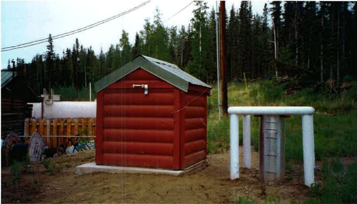
Photo 23. Arctic box and New Community Well, 6/15/00.