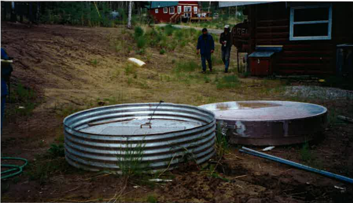
Photo 28. Lift station cover, 6/15/00.