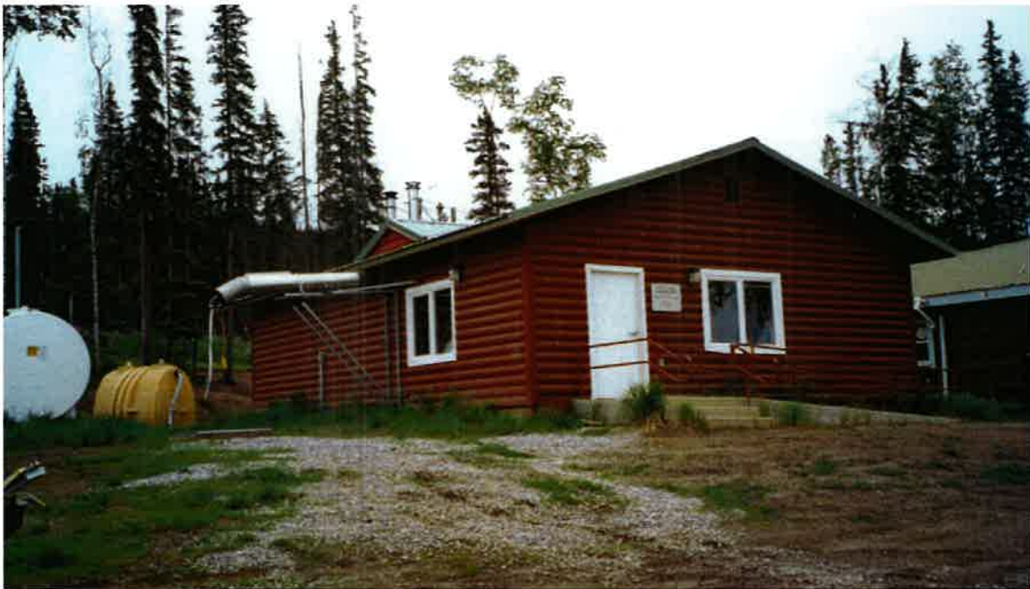
Photo 24. Watering point on northeast side of the Washeteria/Community Center, 6/15/00.