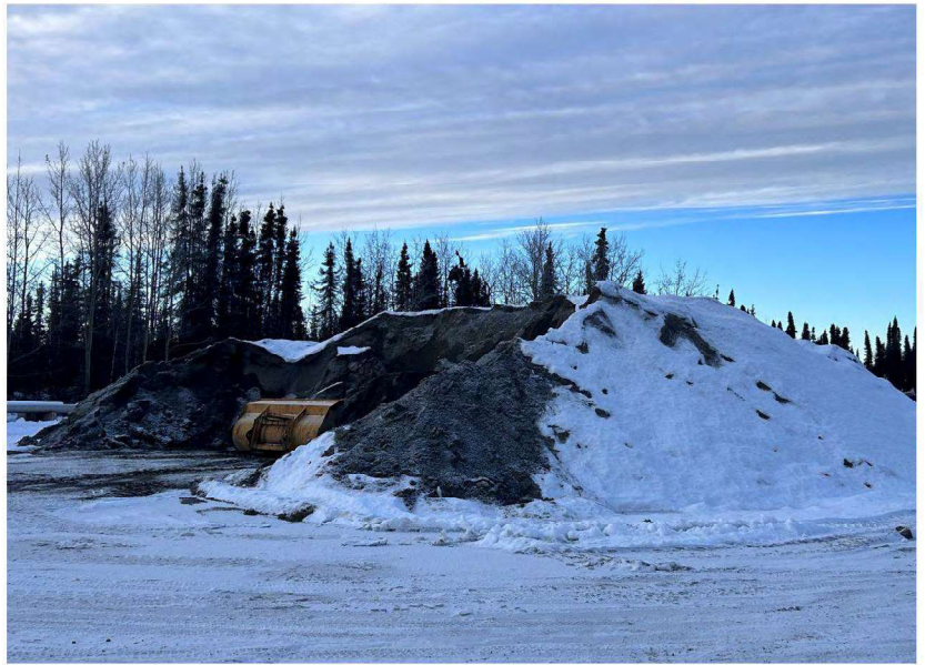
Sand pile at Funny River Maintenance Shop

The City seeks to construct a metal and fabric structure to cover the sand used for winter road maintenance. This structure will be located next to the Funny River Maintenance Shop, and will increase the efficiency of sanding city streets during the winter months. The estimated cost to construct a metal and fabric structure is $300,000.