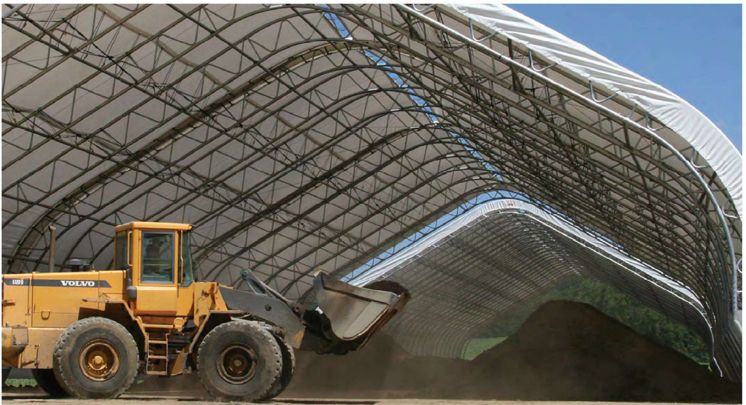
Example of sand storage facility

Project Cost: $300,000 Project Type: Maintenance Facility